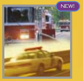
Emergency Buttons – 3 programmable emergency buttons your customers can use to summon help for different types of emergencies.